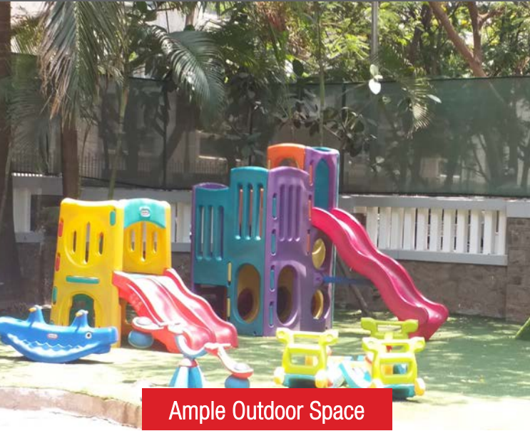
Ample Outdoor Space