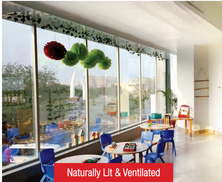
Naturally Lit & Ventilated