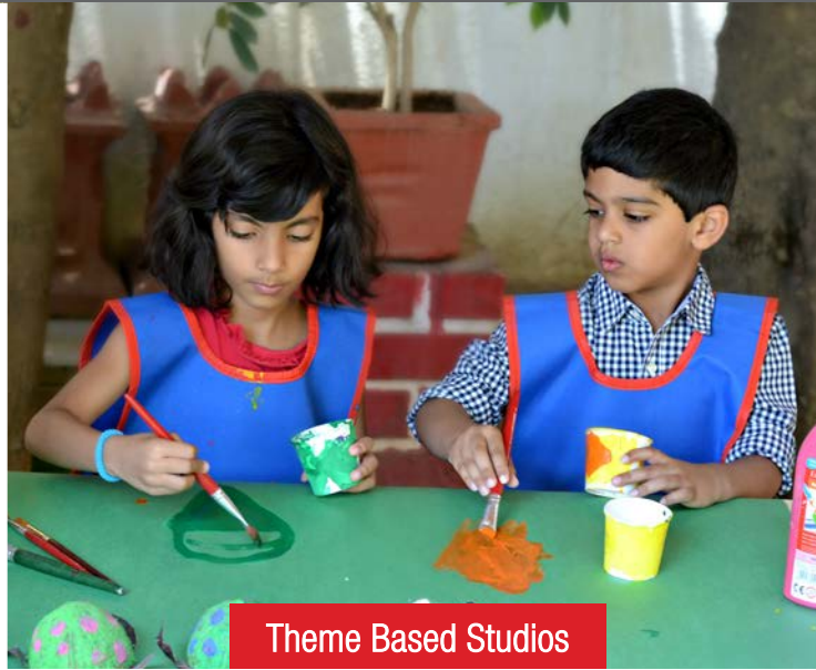
Theme Based Studios