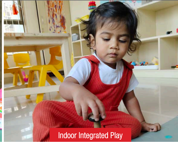
Indoor Integrated Play