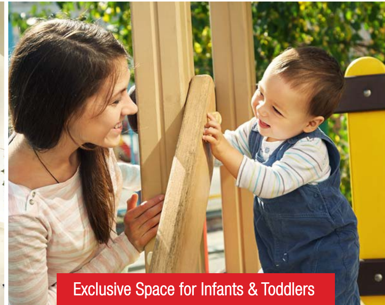
Exclusive Space for Infants & Toddlers