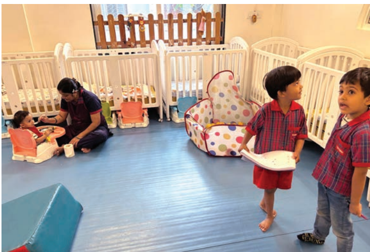
Infant Room Energy Check