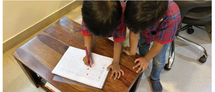
Energy Audit of the SH Office

As part of the Green School Initiative at Vivero, Kalyaninagar the Kindergarten 1 and 2 children were introduced to energy and ways to save the energy in school and in their surroundings. The children were given a responsibility to conduct a weekly check/audit of various types of energy being used at school. The children carry an energy audit book and go around the school to check if the lights, water and other energy consuming devices are being used prudently. They then mark it in their audit book for the respective classes. Here we see the K1 and K2 children introducing and explaining the concept to Nursery peers about their responsibility and the process.