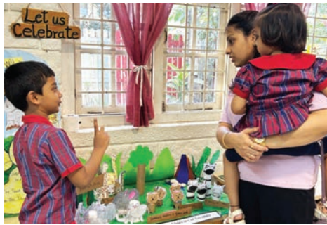
Expressing Views on Endangered and Extinct Animals of Savannah

On 25th January 2025, Vivero hosted an Open House event at all our schools to highlight the facilities, teaching materials, and learning environment to prospective parents. It was a great opportunity for the parents to catch a glimpse of the curriculum and methodologies used at our schools. They also saw how the environment fosters self-confidence by allowing students to take responsibility for showcasing their learning. The Open House gave a platform for meaningful conversations about learning and progress between children and the parents.