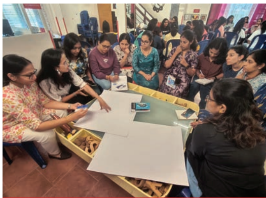
Creating a Story Board

By equipping our facilitators with these dynamic storytelling methods, we aim to create a buzz in the classroom, nurture stronger relationships with our children, and make learning an unforgettable adventure.