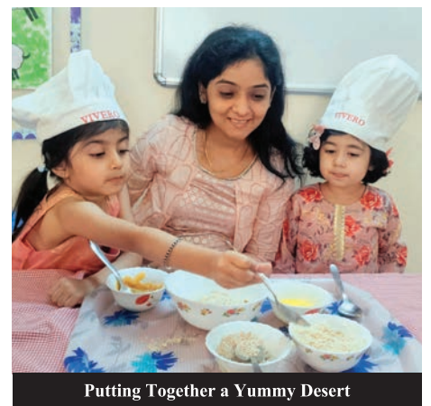
Putting Together a Yummy Desert