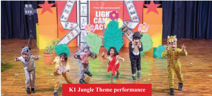
K1 Jungle Theme performance