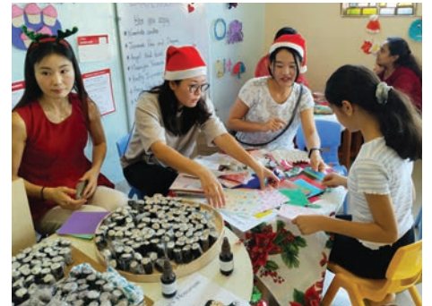
Japanese Mothers Treating Visitors to Home-made Sushi and a Free Origami Session for the Children