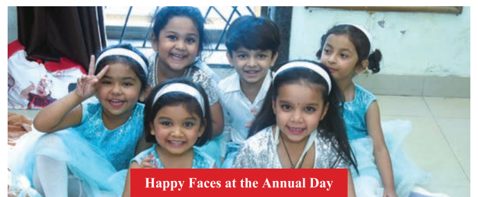
Happy Faces at the Annual Day

Addressing global environmental changes requires a deep understanding of their interconnect- edness and a commitment to implementing sustainable practices across sectors such as energy, agriculture, transportation, and conservation. Our talented performers beautifully captured this message, taking parents on an inspiring journey that encouraged everyone to take steps toward creating a better world for future generations. The Annual Concert was a true celebra- tion of hard work, dedication, and passion. Our young learners at Vivero showcased their creativity and talent after countless hours of rehearsals and preparation. It was a memorable day where the entire community came together to celebrate the spirit and imagination of our performers, leaving us all inspired to make a positive impact on the world.