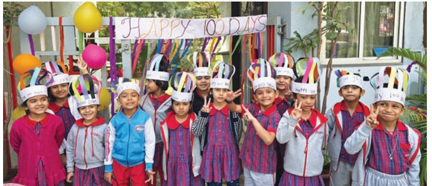
Happy 100 Days of School