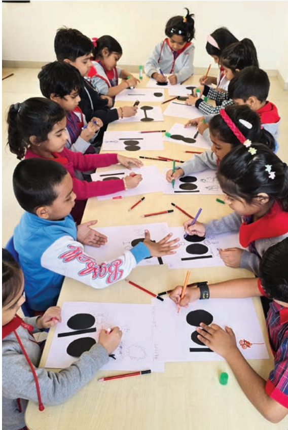
Being Creative with Number 100

No matter the activities planned, celebrating this academic milestone is a big deal for our children, and we look forward to making it a memorable experience for them!