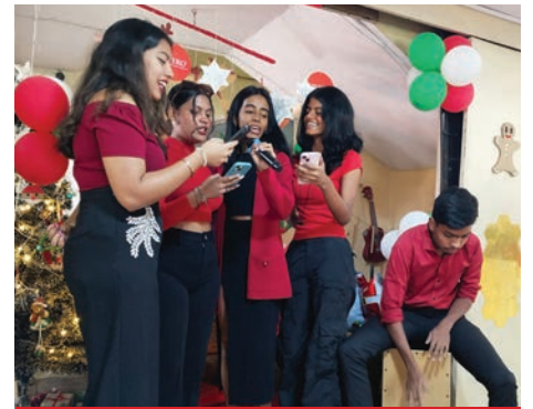
Carol Singers from the youth Division of Local Church had Visitors Swaying to the Familiar Xmas Tunes