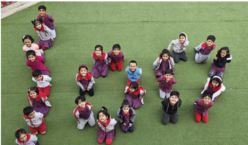
Being Creative with Number 100