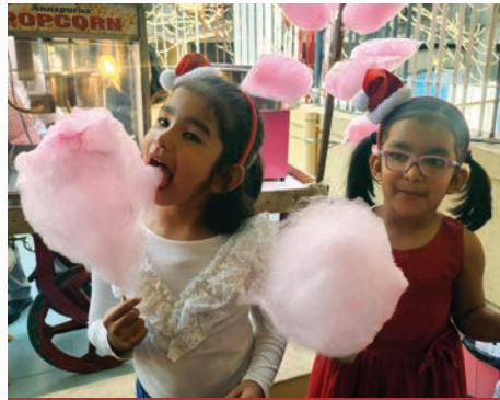
Candy Floss, Popsicles, Popcorn And Treats Galore

The event was a fabulous experience for everyone who attended, and we are grateful to our parents, staff, and children for making it a resounding success! We look forward to next year's Christmas Fete, and to continuing our tradition of giving back to the community.