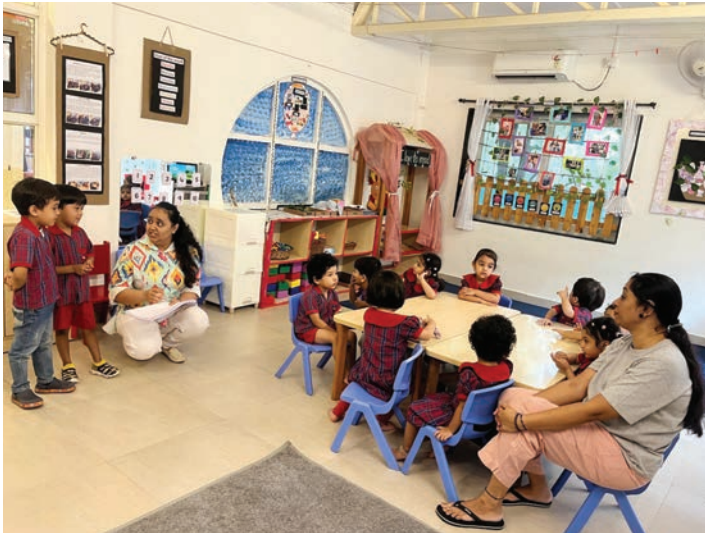
Explaining the Concept to Nursery Peers