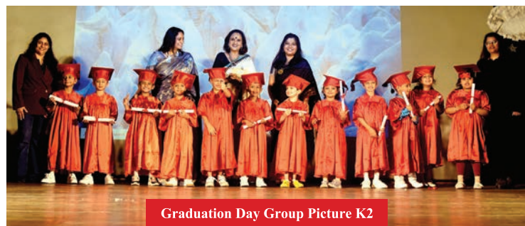
Graduation Day Group Picture K2