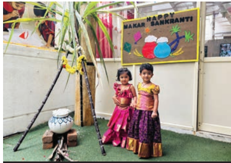
Traditional Attire for Pongal

Our children enthusiastically celebrated Sankranti with a vibrant showcase of cultural activities. The celebration started with a kite-making competition, followed by a role-play activity where students re-enacted traditional Pongal celebrations and cooked the sweet dish. The grand finale was a spectacular cultural performance, where children dressed in their traditional attire danced to a lively song, filling the atmosphere with joy and festive spirit.