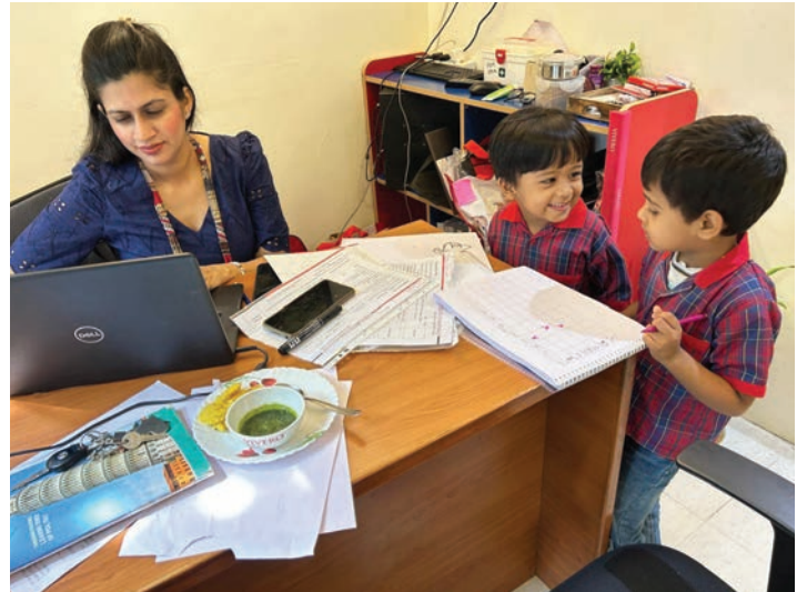
Energy Audit of the PRM Office