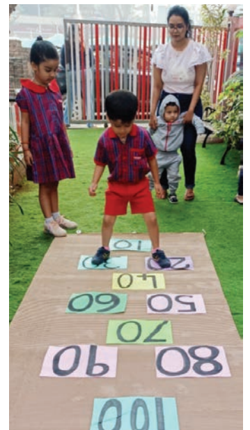
Hopscotch by Tens to Reach 100