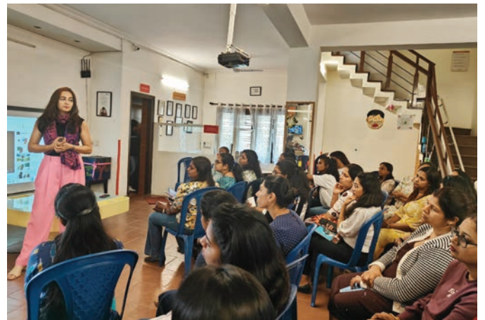
Session on Inquiry in the Classroom