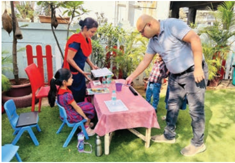
Learning Beyond Classroom