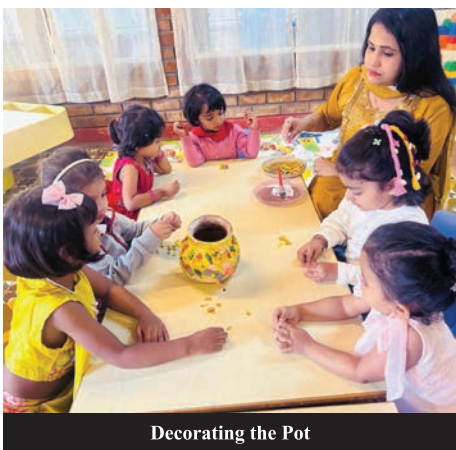
Decorating the Pot