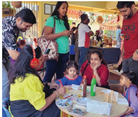
Children Engaging at the Vivero Activity Table