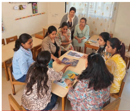
Preparing for a Story Session