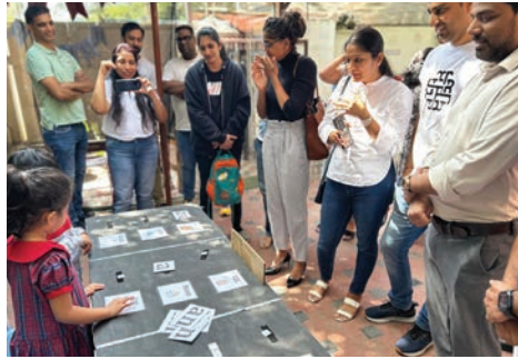
Understanding use of Articles