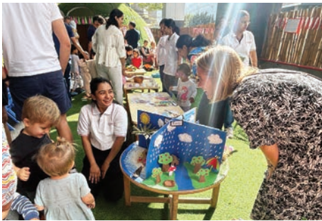
All About Seasons