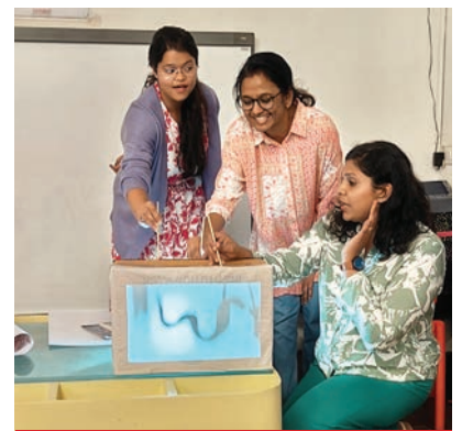
Shadow Story Telling