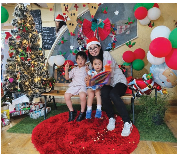
Our Cozy Santa Photobooth - A Huge Hit Creating Memories for our Families