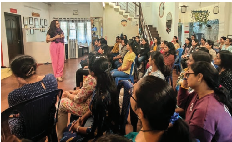
Session on Inquiry in the Classroom