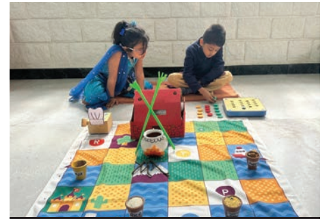
Sankranti Celebrations with Cubetto