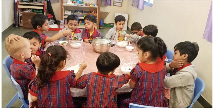
Children Prepared 100 Idlis