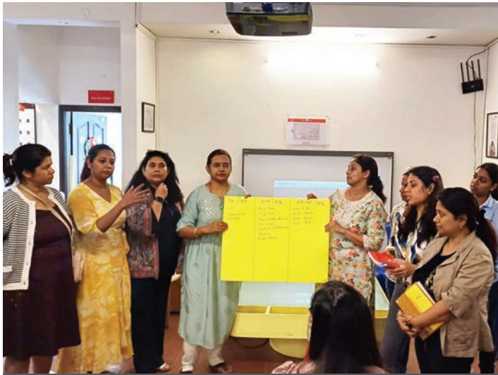
Collaborative Activity Inquiry in the Classroom

This comprehensive training equipped teachers with actionable insights to seamlessly integrate inquiry-based learning into their classrooms, inspiring children to become confident, lifelong learners.