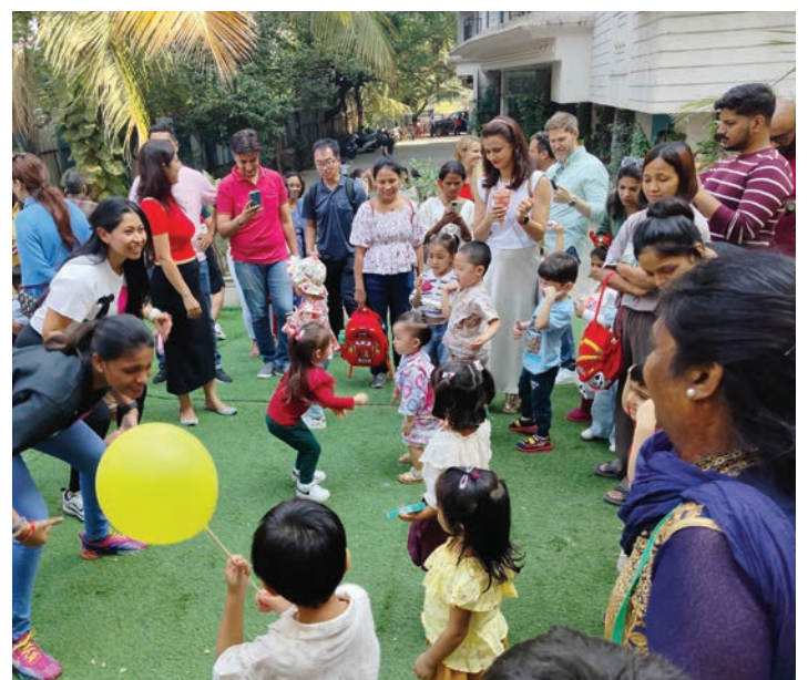
Zumbini for Children Left Them Asking for More