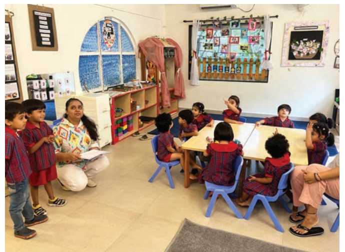
K1, K2 Introducing Energy Audit