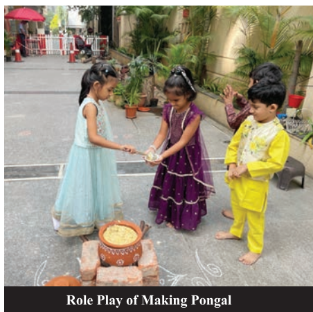
Role Play of Making Pongal