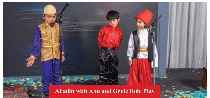
Alladin with Abu and Genie Role Play