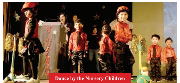
Dance by the Nursery Children