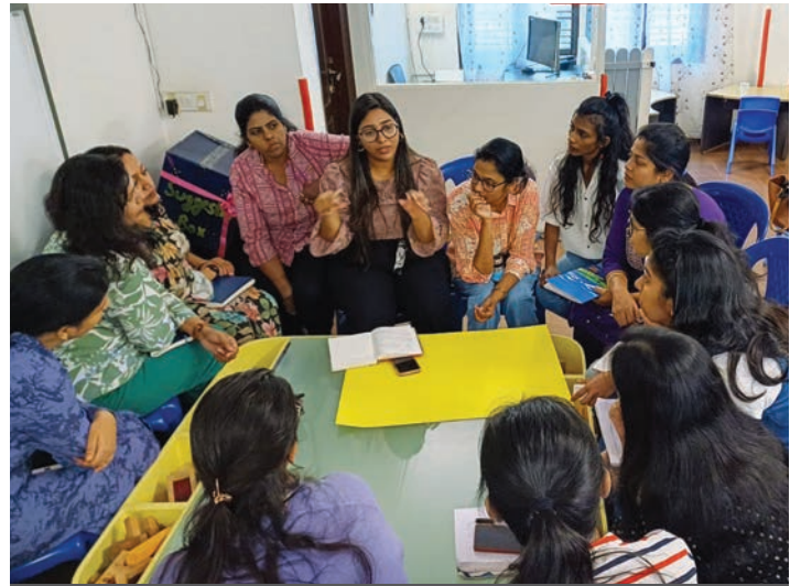
Collaborative Activity Inquiry in the Classroom