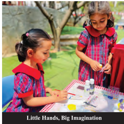
Little Hands, Big Imagination