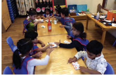
In Unity There Is Strength