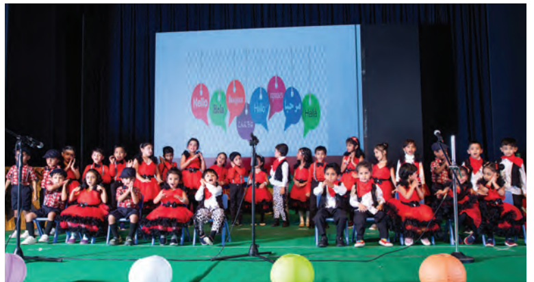
Sing Along the Spanish Song