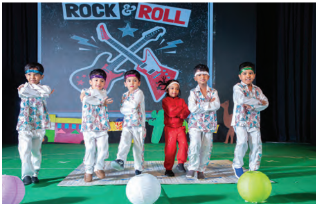
Let's Rock and Roll

Most importantly the evening filled with proud moments and bright smiles, gave the children a sense of accomplishment and joy that stays with them long after the curtain close.