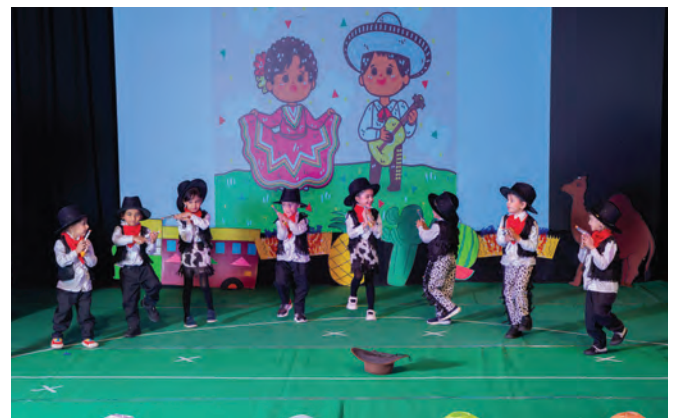
The Cowboys in Movement