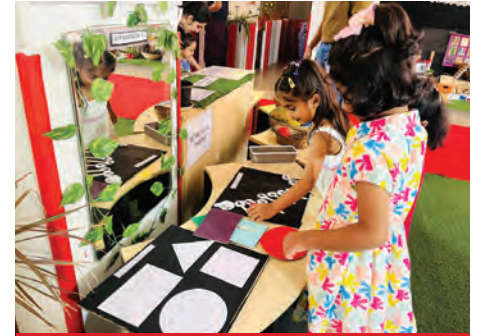
Where Friendships Begin and Memories Grow

Together, these play dates support holistic development by nurturing children's cognitive, physical, social, and emotional growth!