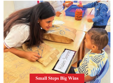
Small Steps Big Wins