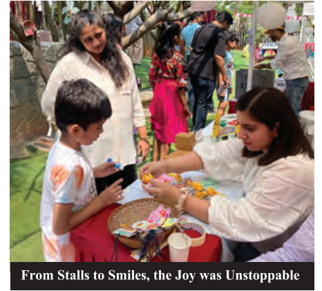
From Stalls to Smiles, the Joy was Unstoppable