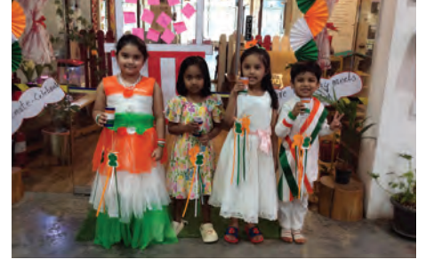
Patriotism Begins Young