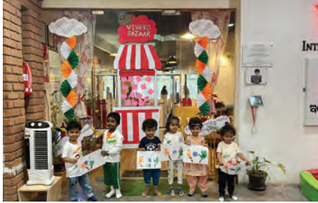
I Love India

At Vivero International Pre-School and Childcare, our little learners celebrated Republic Day with fun and learning! The day was filled with stories about our nation, crafts like making Indian flags with loose parts, and engaging circle time discussions on the significance of Republic Day. Through creativity and conversation, children explored patriotism, teamwork, and national pride in a joyful, nurturing environment.