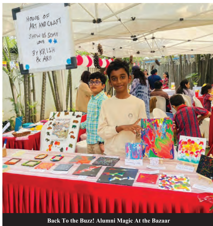
Back To the Buzz! Alumni Magic At the Bazaar