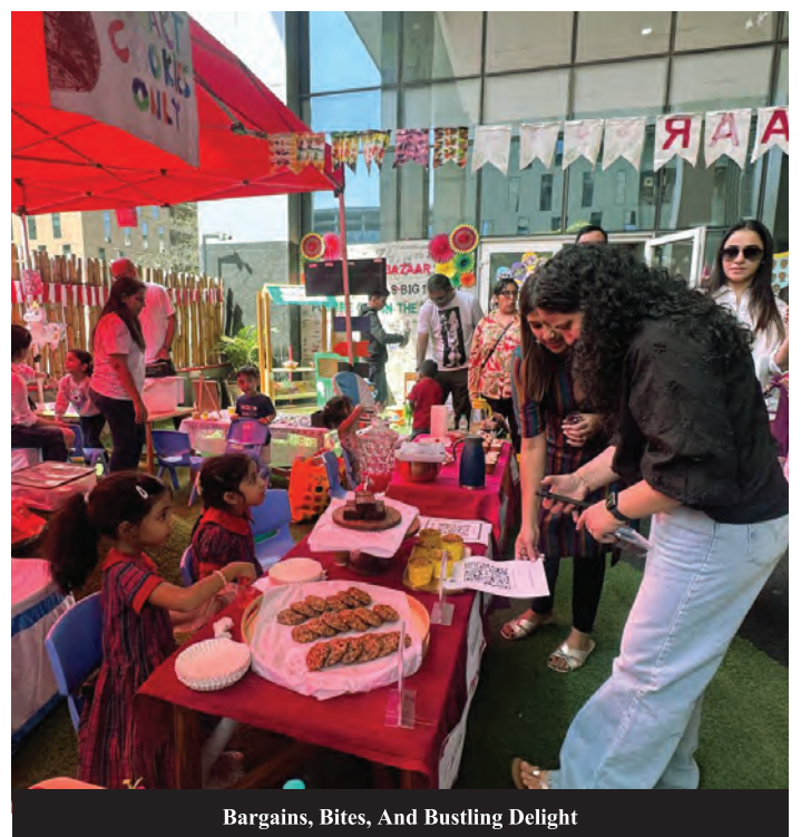
Bargains, Bites, And Bustling Delight