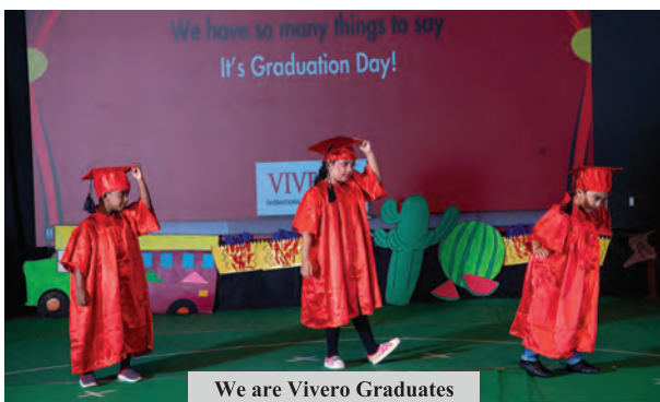
We are Vivero Graduates