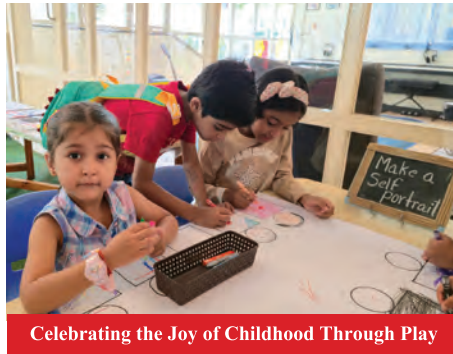
Celebrating the Joy of Childhood Through Play