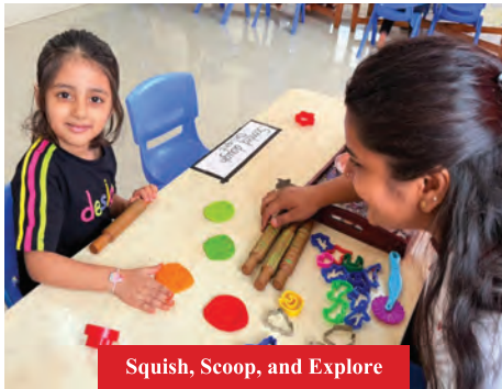
Squish, Scoop, and Explore