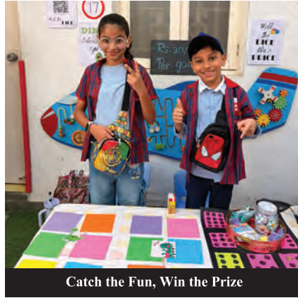
Catch the Fun, Win the Prize

The Vivero Bazaar was not just a marketplace, it was a dynamic celebration of confidence, creativity, collaboration, and communication, beautifully bringing 21st-century learning to life!