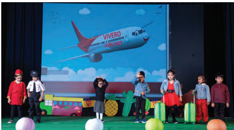
We Are the Vivero Travelers